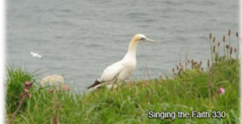
Singing the Faith 330

All things bright and beautiful, All creatures great and small, All things wise and wonderful, The Lord God made them all.