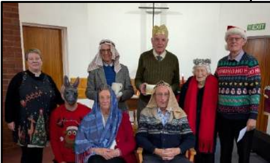
Henlow on Christmas Day – recalling childhood nativity plays and reflecting on some of the nativity characters. We had a laugh!