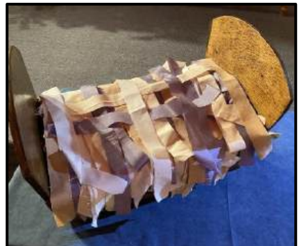
At Trinity's Carol Service, strips of cloth were laid in the manger, to symbolically make a welcoming place for the Christ-child