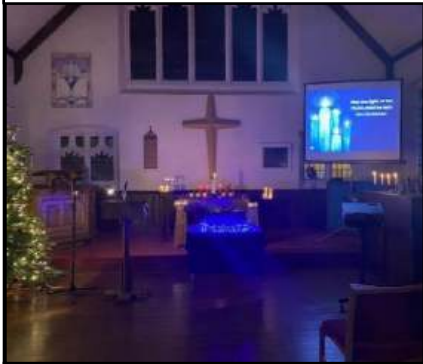
A quiet 'blue' Christmas service at Sandy