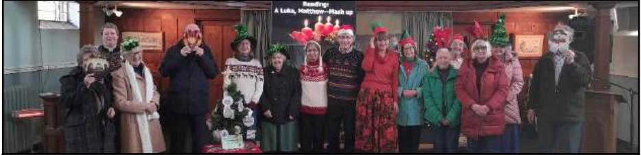
A 'Spoof' Christmas from Langford, with hats and masks showing Christmas trees, puddings, turkey, elves, Brussels sprouts and more!

It seems a long time ago now, but here are a few images from some of the Christmas services in the Eastern Section.